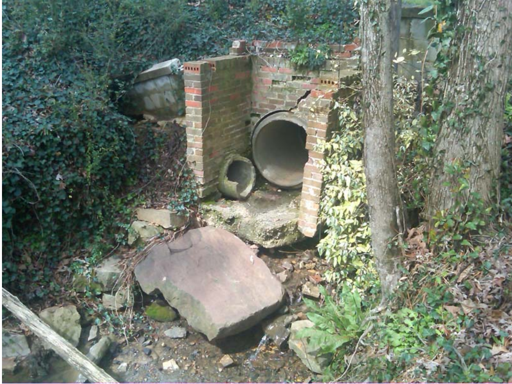
Photo 3 -- Erosion around headwall has likely caused failure which has contributed to pipe being dislodged; attached retaining structure has also partially failed.