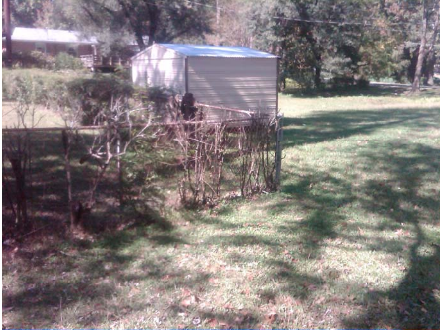
Photo 3 -- Several voids and sunken areas throughout both yards; existing storage shed is to be relocated by property owner.