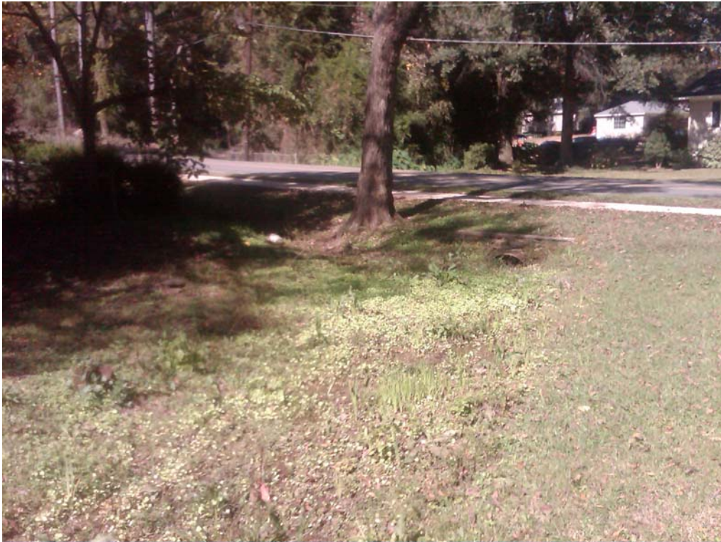
Photo 4 -- Drainage pipe under GreenValley; invert of pipe is silted and pipe does not function properly due to lack of positive drainage away from this section of pipe. Corrective actions to the private drainage pipe will correct this.