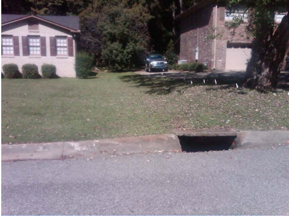
Photo 1 -- Drainage inlet box at road in good condition.