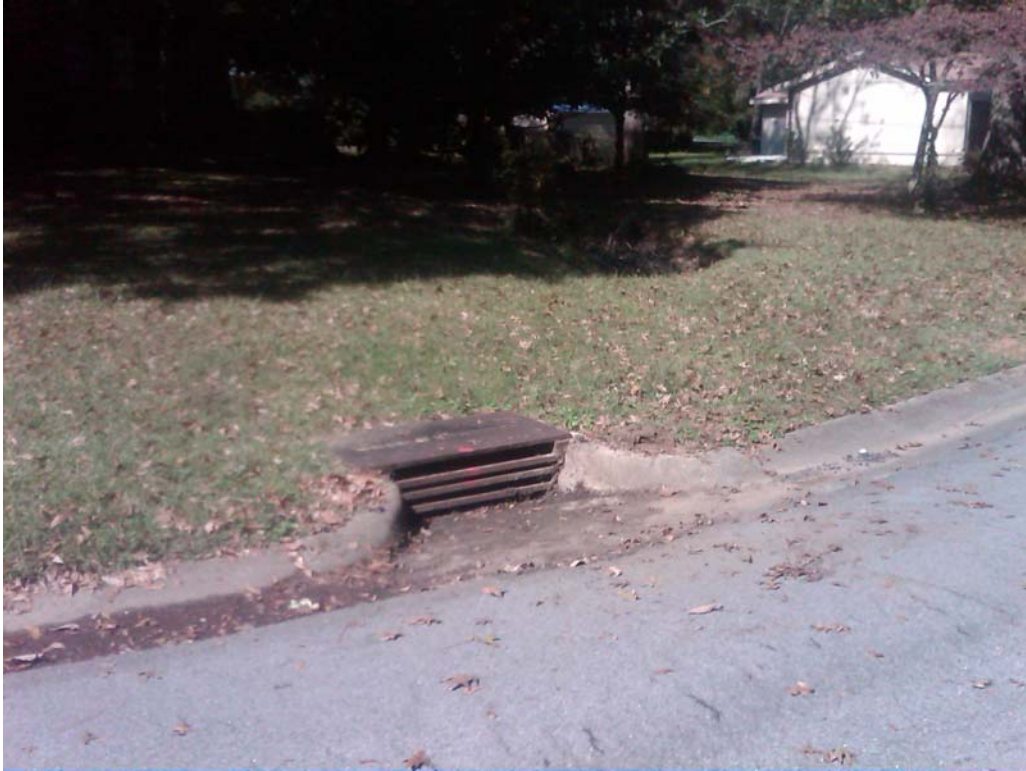
Photo 1 -- Inlet box at street in good condition