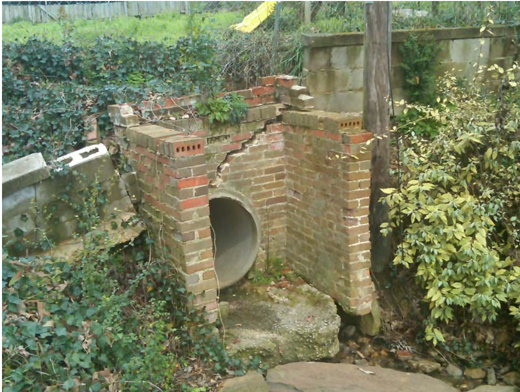
Photo 1 -- Brick headwall has settled and broken loose; pipe attached to headwall has also separated.