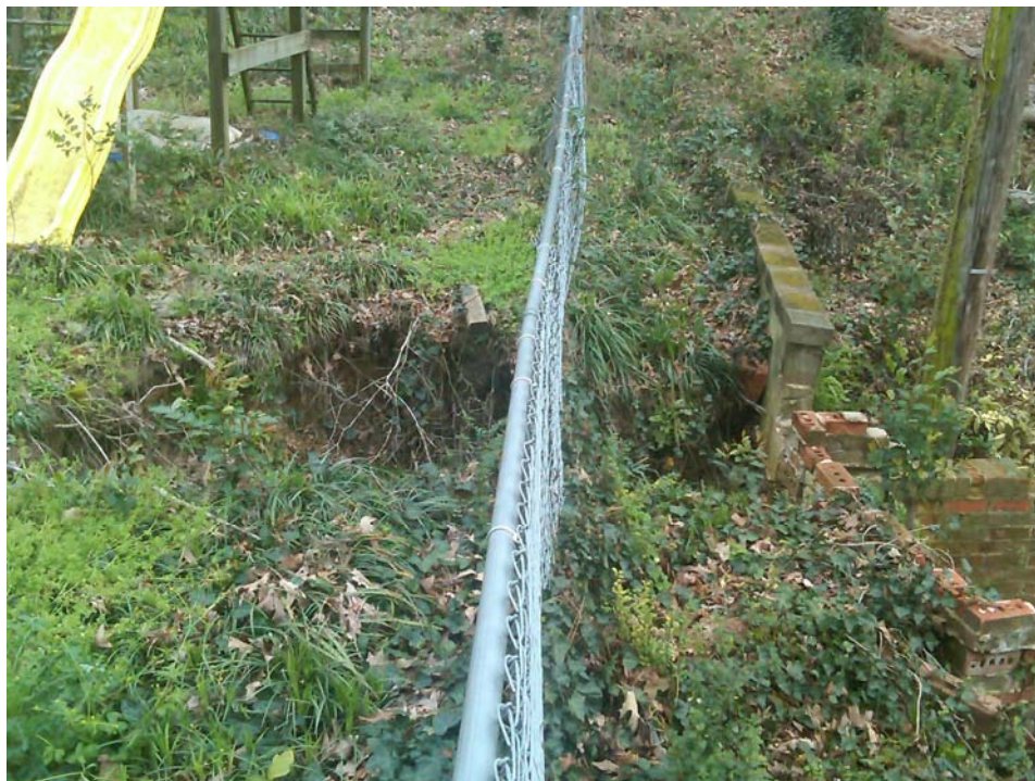
Photo 2 -- Headwall movement and pipe separation has created hazardous voids.