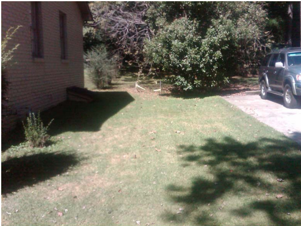
Photo 2 -- Sunken spots in grass area.