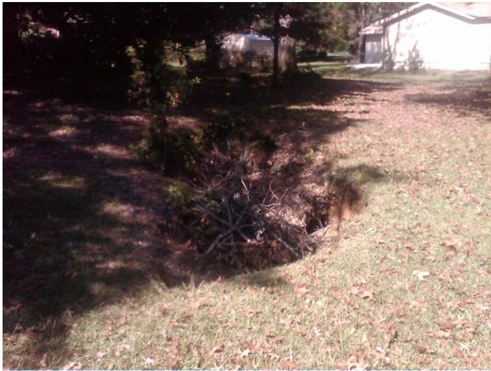
Photo 2 -- Large void in yard at 4025 Meadowview Circle due to pipe deterioration.