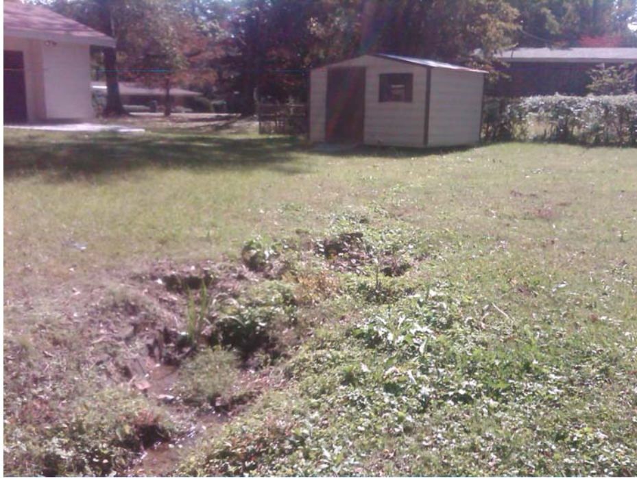
Photo 4 -- Neighbors report previous property owner installed metal drums to pipe in open ditch; these metal drums have rusted, collapsed, and mostly disintegrated.