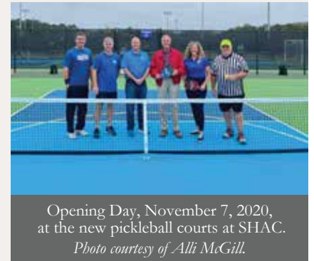
Opening Day, November 7, 2020, at the new pickleball courts at SHAC.

The pickleball program is going strong! Youth through senior adults are playing pickleball in the gym at the former Vestavia Hills Elementary Central, and now at the new outdoor courts at SHAC.