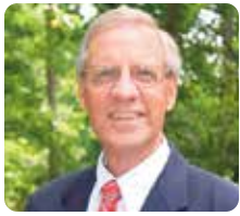
Ashley Curry, Mayor City of Vestavia Hills