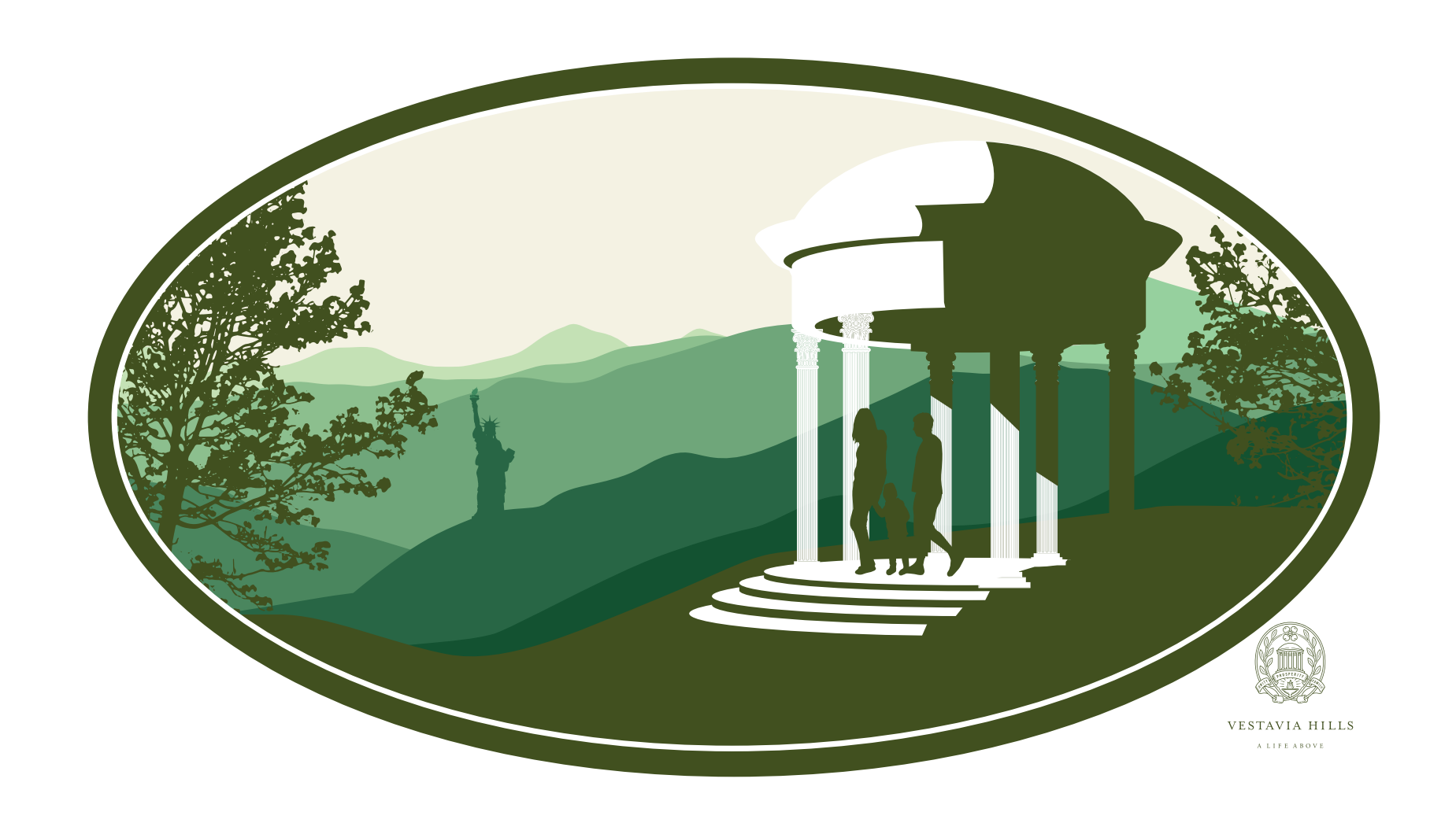
Vestavia Hills A COMPREHENSIVE PLAN FOR COMMUNITY SPACES