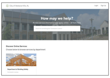
STEP 1: Visit https:// vestaviahillsal. viewpointcloud.com and select "Department of Building Safety."

Note: Your Contractors Business License Number will change. You will be assigned a new Business License number and, after renewing for 2022, you will no longer utilize the license number referenced in your renewal notice.