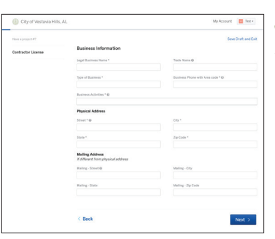
STEP 9: Enter your business information and click "Next."