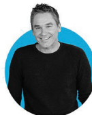
MARCUS BUCKINGHAM BEST SELLING AUTHOR, GLOBAL RESEARCHER, AND STRONG'S REVOLUTION CHIEF