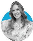
KENDRA SCOTT DESIGNER FOUNDER, EXECUTIVE CHAIRPERSON