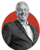
JOHN C MAXWELL #1 LEADERSHIP EXPERT AND BEST SELLING AUTHOR