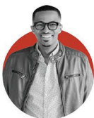
RYAN LEAK SPARKS COORDINATOR & WALL STREET JOURNAL BEST SELLING AUTHOR