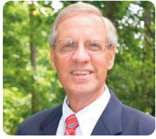
Ashley Curry, Mayor City of Vestavia Hills

A joint publication of the City of Vestavia Hills, Vestavia Hills City Schools & Vestavia Hills Chamber of Commerce